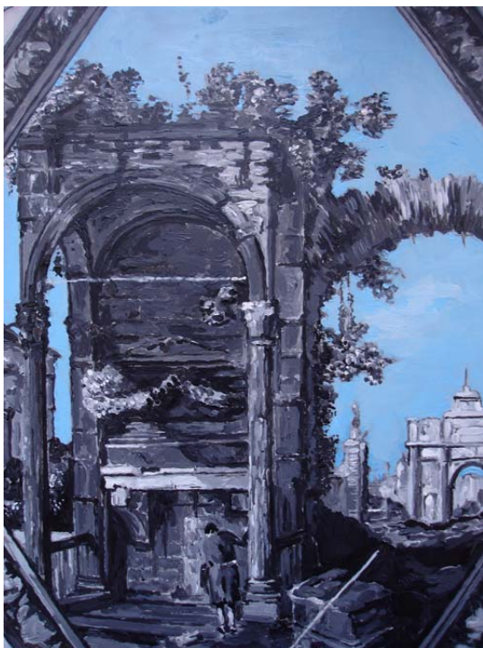
Sofia Leitão, detail of a sculpture (acrylic on zinc), 2009