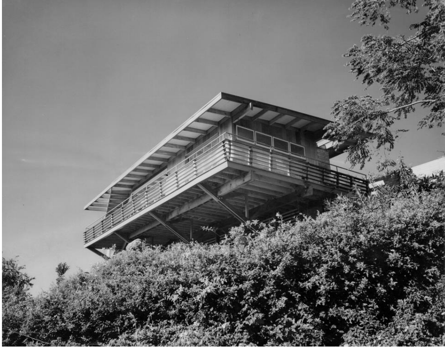
Leonard Oechsli residence, 1951