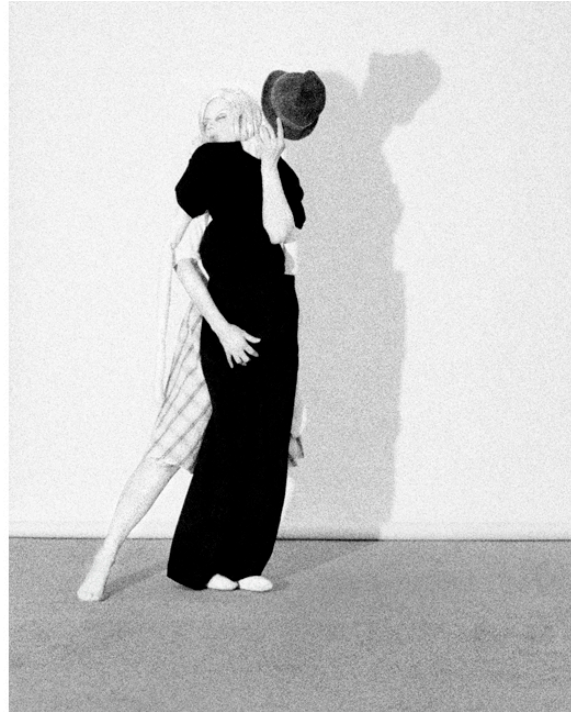
Le Désir , 2007, Lambda