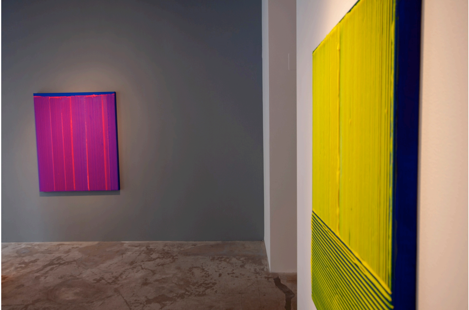
Left: Acrylic on canvas, 115 x 140 cm